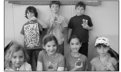
Grade 3 celebrated Yom Ha'atzmaut Israel's 61st Birthday making Star of David necklaces.)

As I have said many times over the years, the philosophy of our Religious School has