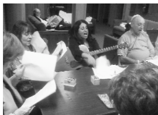
A sing-a-long at the Great Barrington Retreat.