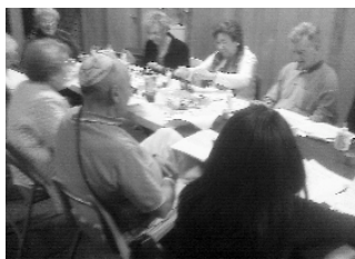
Making Havdallah spice boxes to bring home.